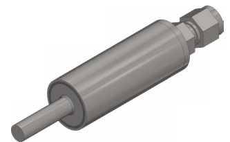
Probe B: Soil Temperature