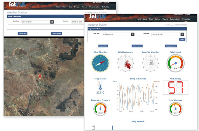
Monitor Multiple Sites via a single Remote Web Portal

It also provides the ability to setup crucial alerts when certain thresholds are reached.