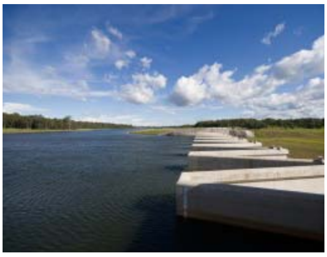
The solution is to be rolled out across a number of sites

Oil, gas, & other fluids - in pipelines and tanks for levels and pumps for status & control & more!