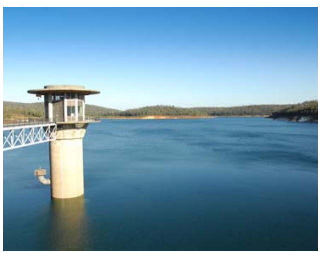
Satellite communications ensure reliable remote access