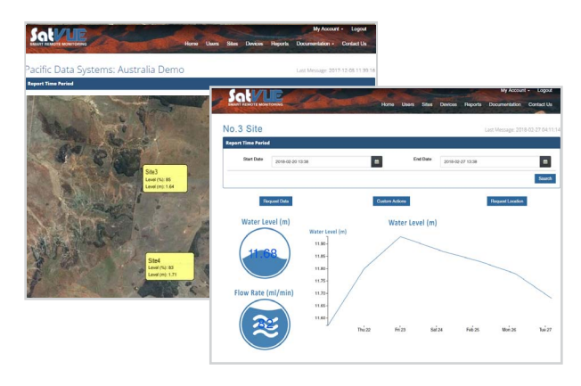
Monitor Multiple Sites via a single Remote Web Portal